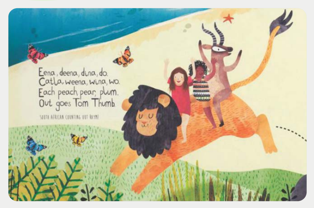
This resource is licensed under Creative Commons BY-NC-ND

WHY IT MATTERS Reading provides children with a wide range of ideas, views and experiences.